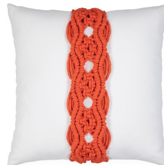
20R2 PALOMAR MELON W - 20" H - 20"