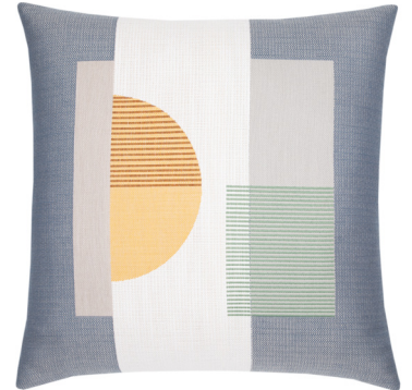
27H1 CATALYST DAYBREAK W - 22" H - 22"