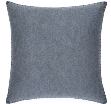
28L2 ANGORA SLATE W - 20" H - 20"