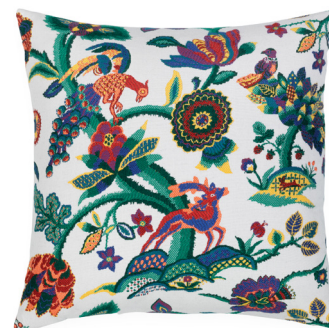
20P1 FOLK ART JEWEL W - 20" H - 20"