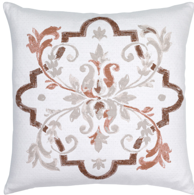
15R2 TALAVERA CLAY W - 20" H - 20"