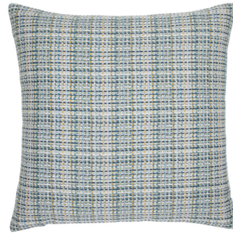
27J2 EMPOWER FLOW W - 20" H - 20"