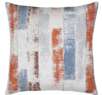
19N2 ENDEAVOR SUNSET W - 20" H - 20"