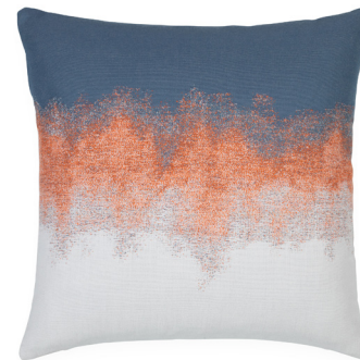
19Q2 ARTFUL SUNSET W - 20" H - 20"