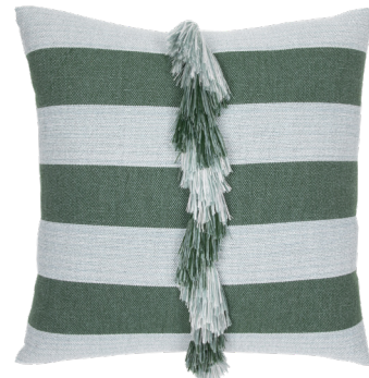
27F2 AMPLIFY VERDE W - 20" H - 20"