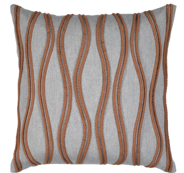
19Z2 RIPPLE SIENNA W - 20" H - 20"