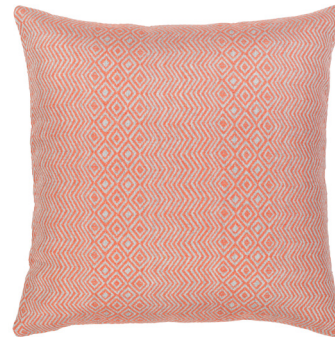
20L2 KANGA PAPAYA W - 20" H - 20"