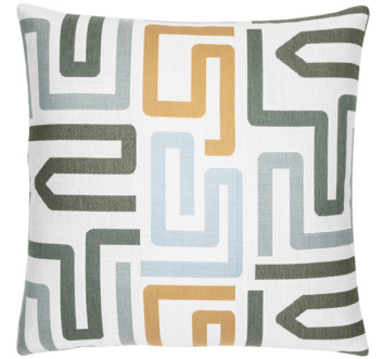
27K2 AGILITY NATURE W - 20" H - 20"