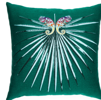
19Q2 SERAPE JEWEL W - 20" H - 20"