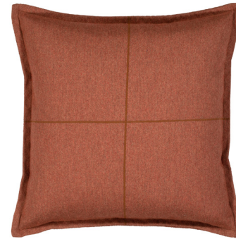
19W2 BESPOKE CLAY W - 20" H - 20"

The fresh colors of the Audacity collection allow bold combinations. Our new, trending Clay yarn mixes beautifully with neutrals and blue, or pops of color. The richly fringed Namotu is among several exclusive designs that offer stunning impact and versatile styling.