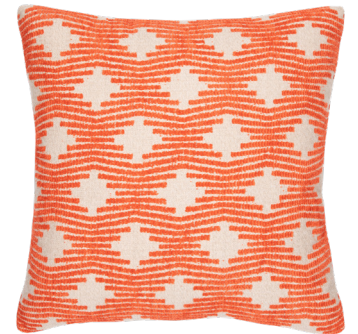
27B2 PIZZAZZ ENERGY W - 20" H - 20"