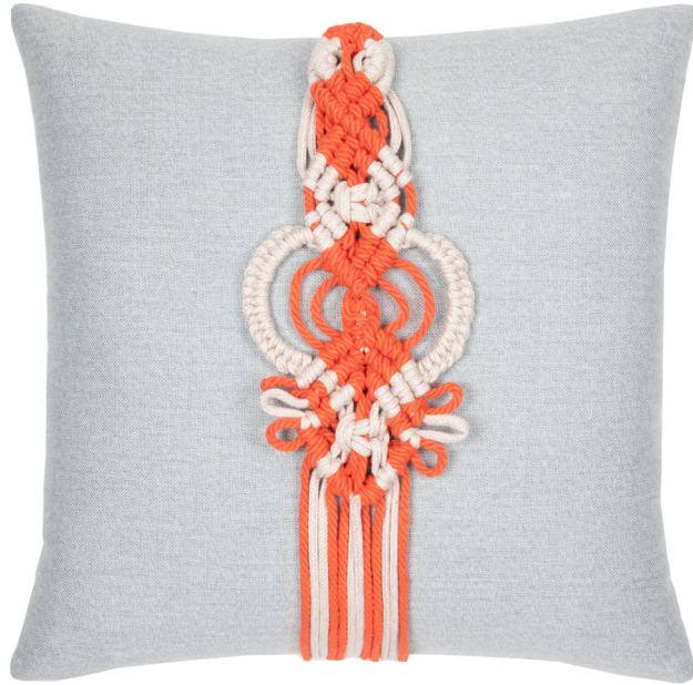
27A2 PEACEFUL ENERGY W - 20" H - 20"