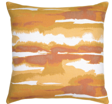
25Q1 IMPRESSION SUNRISE W - 22" H - 22"