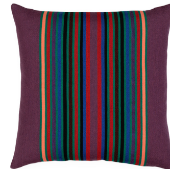
14X1B CHAMELEON EMERALD W - 22" H - 22"