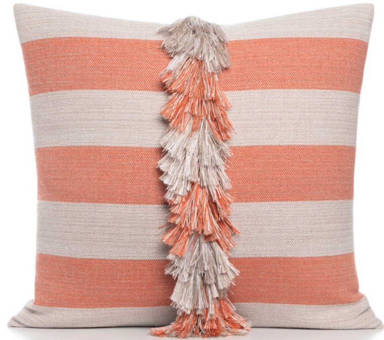
POLYFILL INSERT FIRM