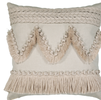
22X2 TAVARUA LINEN W - 20" H - 20"