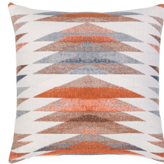
19P2 SYMMETRY SUNSET W - 20" H - 20"