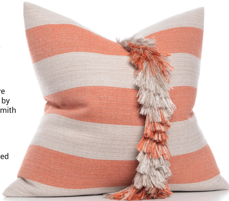
FAUX DOWN INSERT PLUSH