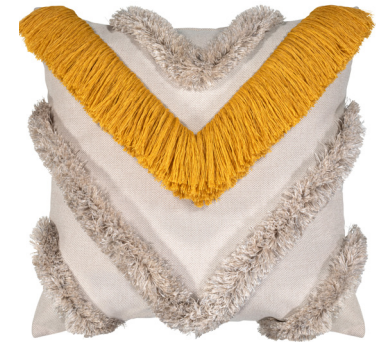
23J2 NAMOTU W - 20" H - 20"