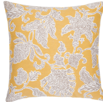
27L2 TRANSPIRE HOPE W - 20" H - 20"